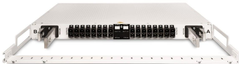
300CB08-C (Rear view)