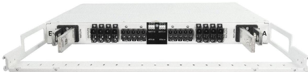
240GT54-C (Rear view)