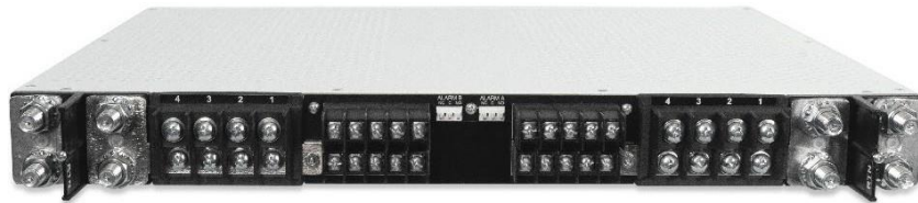
240GT54 (Rear view)