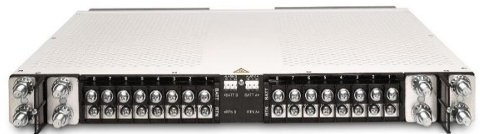
300CB08 (Rear view)