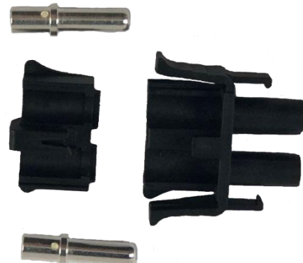
2.4mm Connector Kit