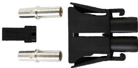
4.0mm Connector Kit