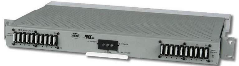
Fig. 1: 0HPGMT05R Front View

For applications that require up to 15A per position distribution, the Amphenol Network Solutions 0HPseries fuse panels are an ideal fit. Fuses can be mounted adjacent to each other in thermally isolated fuse holders. Choose from 100A dual-feed or single-feed configurations.