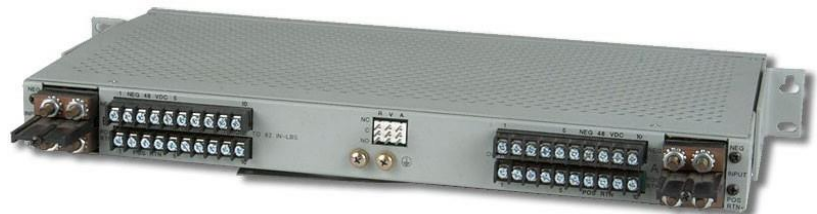
Fig. 2: 0HPGMT05R Rear View