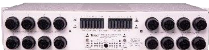
009-8004-0208 Front View