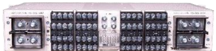
009-8004-0208 Rear View