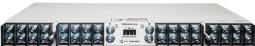
Fig. 2: 009-7001-0104B Rear View